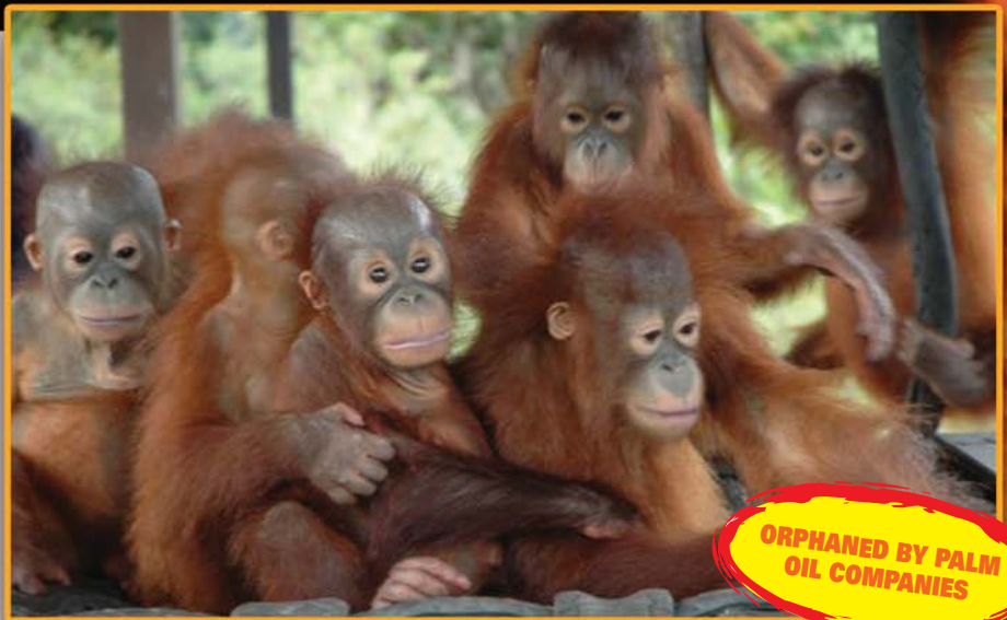
Their mothers shot, knifed, beaten or burnt to death.

Answer: It costs the lives of about 50 orangutans every week, not to mention a lot of other wildlife.